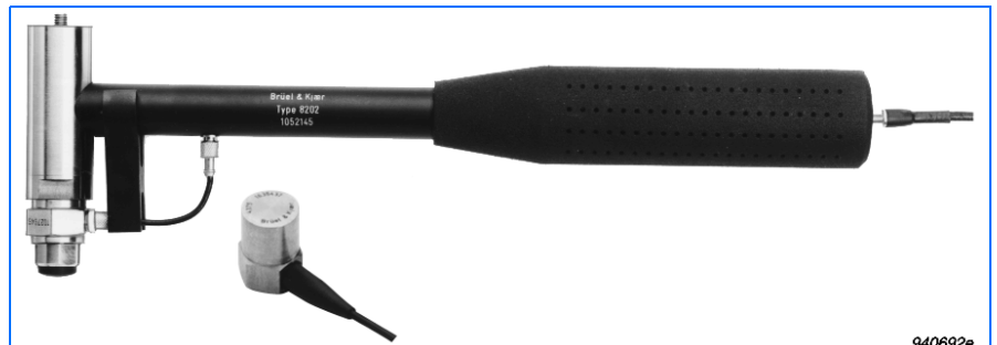
Fig.2 An impact hammer and accelerometer - the front end of a mobility measurement system

Mathematical Modelling. Mobility measurements taken at many points can form the building blocks of a mathematical model of the structure. This is the basis of modal analysis. Existing mathematical models, such as a Finite Element Model, can be verified.